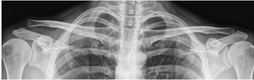
Fig. 2 True anteroposterior standing radiograph of the acromioclavicular joint bilaterally, with the x-ray beam directed with a 10° to 15° cephalic tilt (the Zanca view) and with use of 50% of the exposure that is used in making a standard radiograph of a normal shoulder, comparing the injured right acromioclavicular joint (left side of image) with the normal left acromioclavicular joint (right side of image).

illustration of the Rockwood acromioclavicular joint-injury classification system 4,10,11 . Radiographs are the initial imaging modality of choice for diagnosis and classification of acromioclavicular injuries. In order to enhance visualization of the acromioclavicular joint, it is necessary to use one-half of the x-ray exposure that is used in a standard radiograph of the shoulder. The Zanca view (in which the x-ray beam is directed with a 10° to 15° cephalic tilt) is the most accurate radiograph to use in visualizing the acromioclavicular joint 12 . Due to variations in the anatomy of the acromioclavicular joint, a bilateral Zanca view is recommended to visualize both acromioclavicular joints on a single cassette (Fig. 2). Bearden et al. 13 reported that the average distance between the superior aspect of the coracoid process and the inferior aspect of the clavicle varies from 1.1 cm to 1.3 cm and that a 40% to 50% difference in coracoclavicular interspace between the normal and affected shoulders indicates complete disruption of the coracoclavicular ligaments, whereas Rockwood and Young documented complete disruption with a side-to-side coracoclavicular interspace difference of just 25% 14 . Furthermore, an axillary view is essential in diagnosing type-IV acromioclavicular joint separations, in which posterior displacement of the clavicle occurs. Stress radiographs to differentiate between type-II and type-III injuries have also been described. This is typically done with